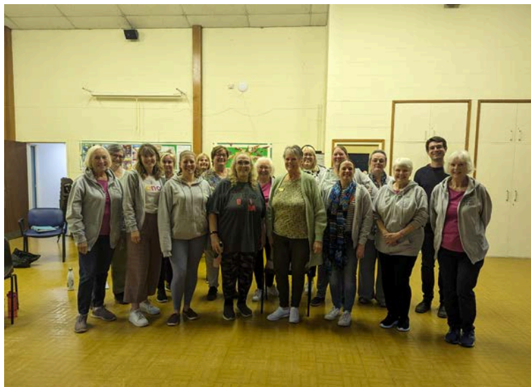
Main Street Sound

The great British weather didn't let us down, during the evening there was an almighty hailstorm which luckily had finished before I headed back to Durham with a smile on my face.