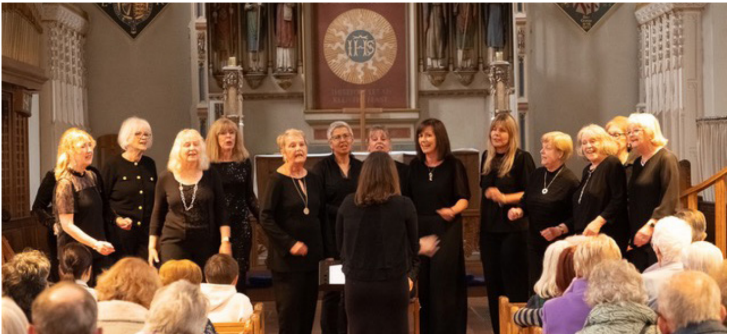
Velvet Harmony 1