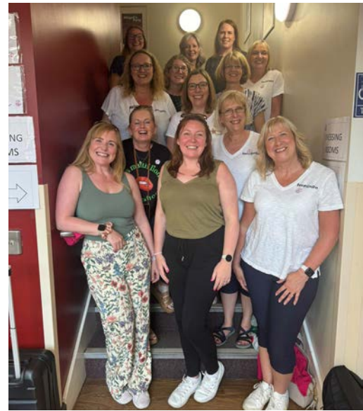
Cheshire Chord Company prelims quartets

In preparation for our exciting entry into the Barbershop Harmony Society Convention 2025, Denver, we have embarked on a series of fundraising efforts. We kickstarted our fundraising at the British Association of Barbershop Singers (BABS) convention, and we extend our heartfelt thanks to