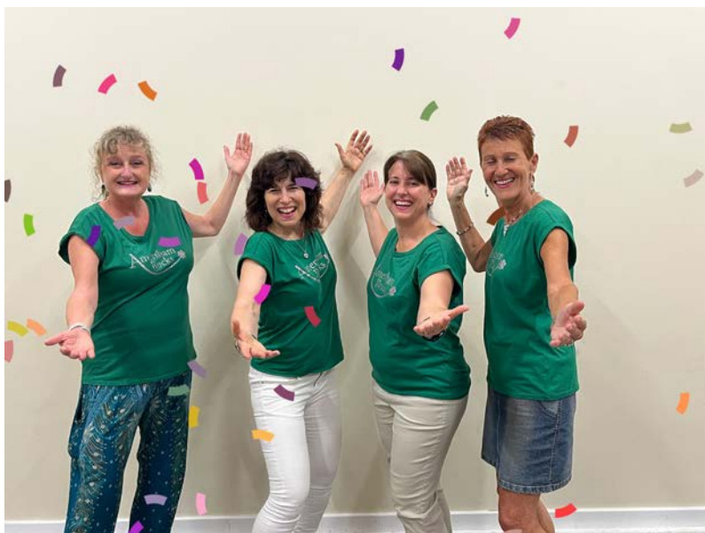
Some of Amersham A Cappella's singagram team

and fundraising tips and triumphs. The meeting confirmed that our ideas so far are on track. To give you a flavour – we have a recipe calendar with an Amersham twist, in planning. We've already had two car boot sales, sold some costumes and bespoke badges. We have a Singagram team preparing to wow unsuspecting Birthday peeps [and any celebration in fact!] and in the Autumn we are having a fabulous fashion show in stunning surroundings. Our Flashmob gang are also hard at work and ideas continue to pour in – catch them on our Facebook Page!