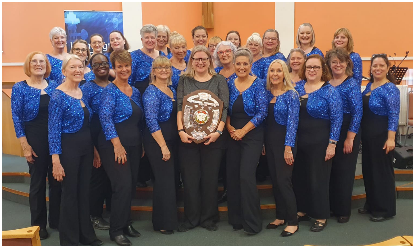
Silver Lining with their winners' shield