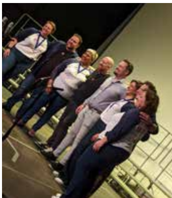
Barberlicious and Vocal Spectrum

and supporting some of our Barbershop communities. In March, we were privileged to support the faculty at LABBS and BABS Education and Judging Singing Day in Coventry. As well as having an amazing day of singing and learning, we also raised over £700 towards our trip to BHS in Cleveland, selling cake, pins, keyrings and raffle tickets. A huge thank you to friends from Crystal Chords and Silver Lining for their donations to the raffle, baking cakes and some delicious chutneys and preserves. We are blown away by all the amazing help and support we have been given - it really means the world.