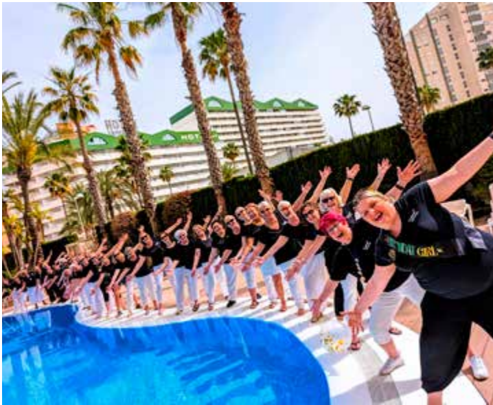
The Crystals having fun in the sun