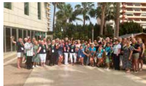
Cheshire Chord Company in Calpe

As we bade farewell to Calpe and the unforgettable memories we created,