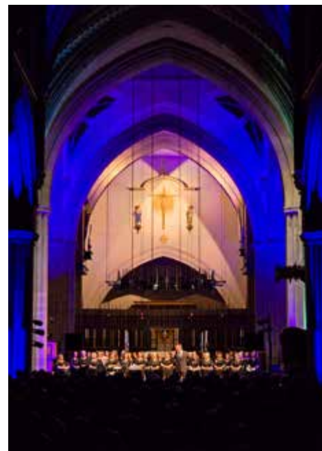
Performing with Russell Watson at Blackburn Cathedral

I don't like to brag, but I am going to! Russell was on Rylan Clark's show on Radio 2 the week after, and made a point of saying how wonderful our chorus was.