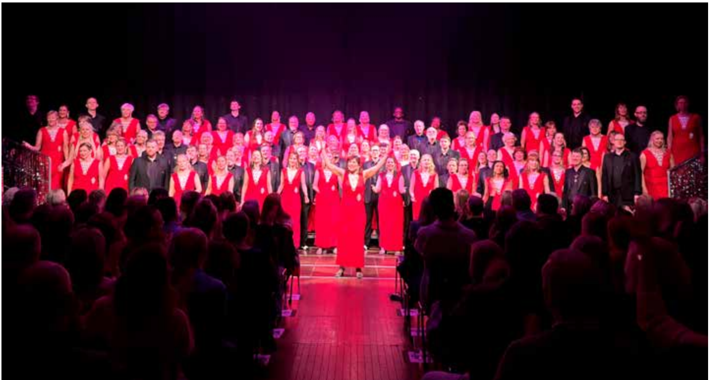
A Kind of Magic with Cottontown Chorus