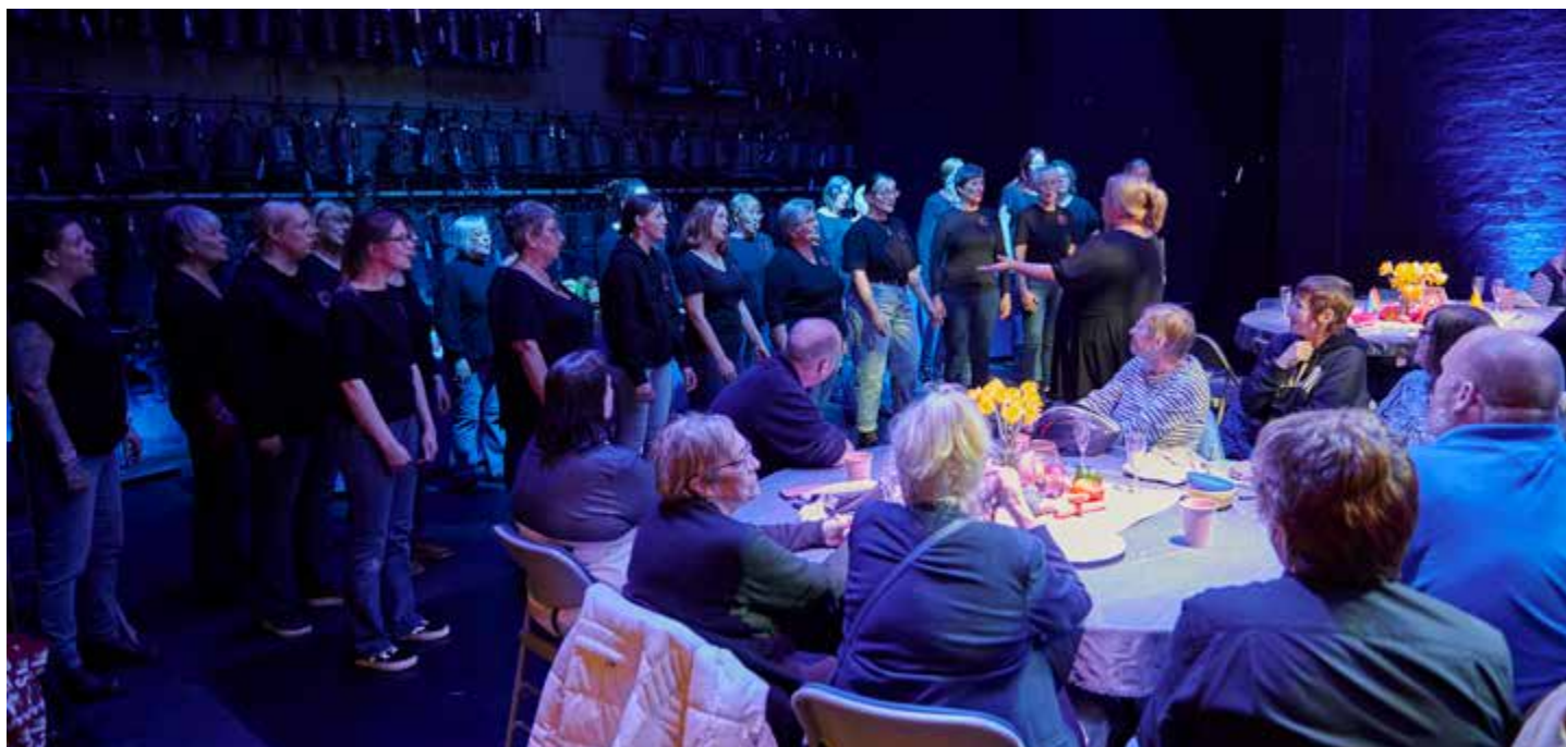
The first night of our Learn to Sing course