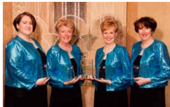
Millennium Bronze winners, Crackerjack!