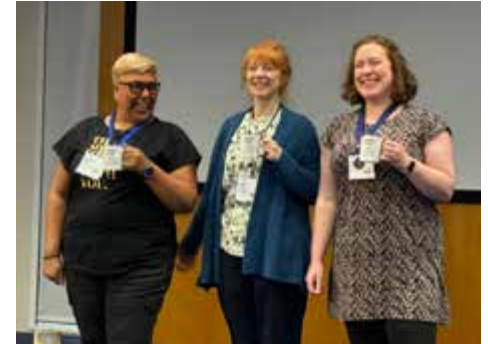
Experienced quartetters who 'judged' the show