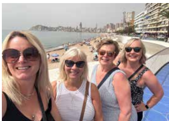
In House Quartet