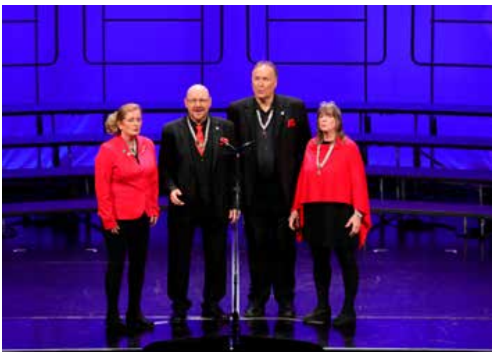
Senior Quartet Champions, Mixed Blessings

BABS hosted their marvellous Sing 2024 Convention at the end of May. It was such a wonderful event, with barbershoppers from across the UK (and beyond!) coming together to help BABS celebrate their 50th Anniversary year. Congratulations to everyone who crossed the stage, and sincere thanks to the army of BABS volunteers who worked tirelessly to make the weekend so memorable.