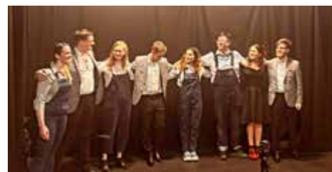
Hot Ticket and These Notes

One of the great things about putting on a show is having the opportunity to highlight those songs that don't have a