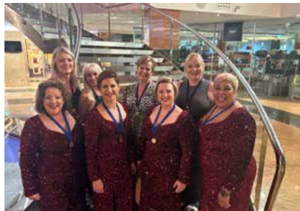
In House and Barberlicious

After our busy couple of days, it was only fair to unwind and enjoy some fun in Benidorm! With its vibrant nightlife, there was no shortage of options for excitement.