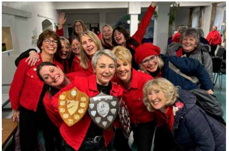
Red Rock A Cappella are delighted with their three awards!