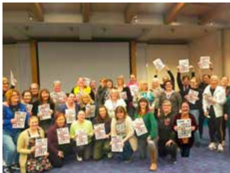
Harmony Hotshots: Sang with everyone else in the other three parts