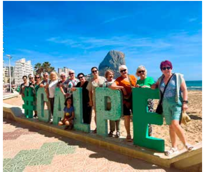
Just like LABBS' Convention 2023, but with sun!