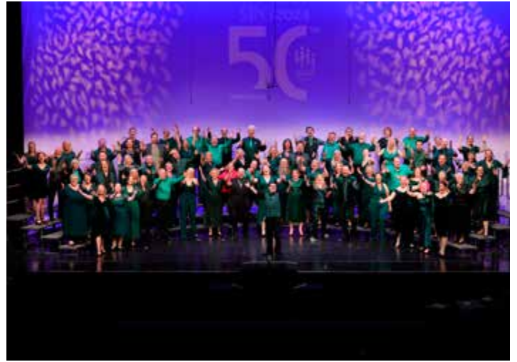
Mixed Chorus Champions, Crucible Vocal Project