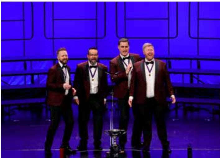
Quartet Champions, Fifth Element