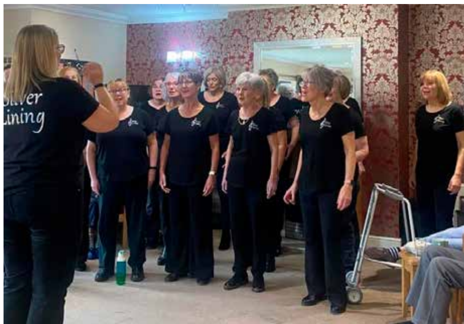
Silver Lining at Herald Lodge