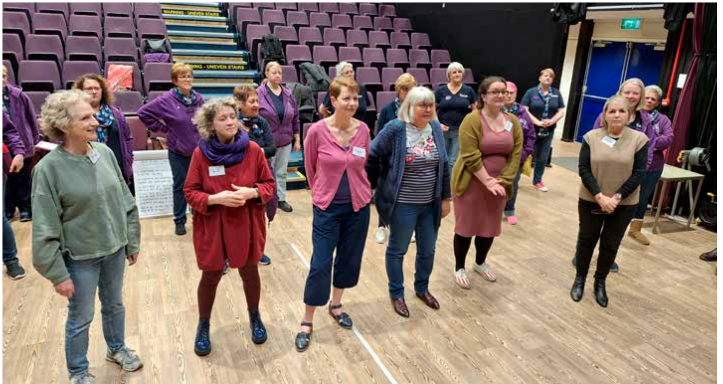
The first night of our Learn to Sing course