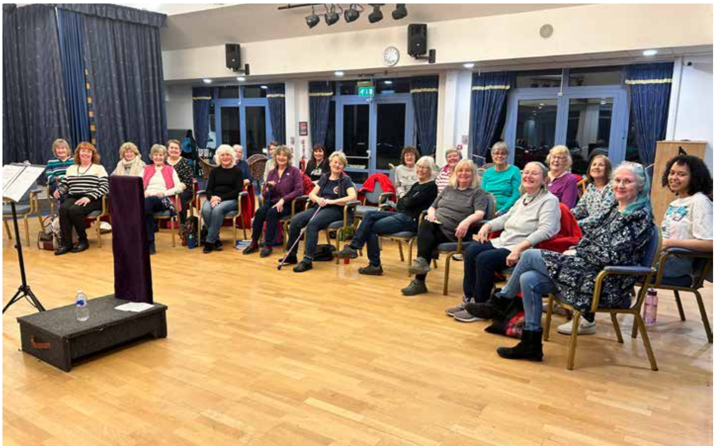
Our new rehearsal venue. A much brighter and airy space.