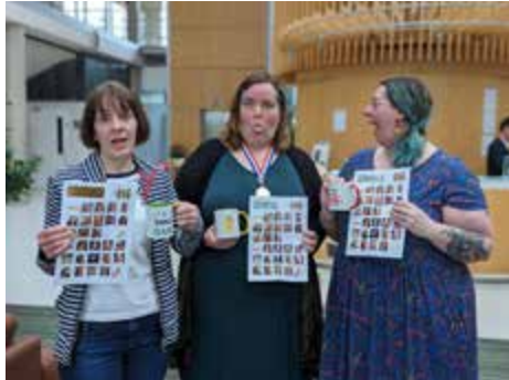
Exhausted - cheeky - shocked - 3 White Rosettes