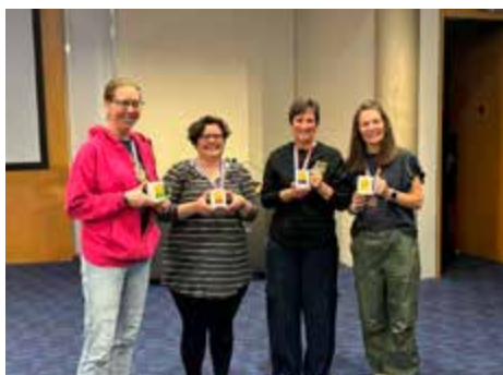
Third Place quartet, Best for Last