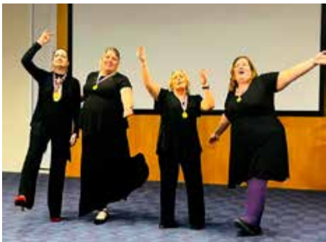
First place quartet, 3.5