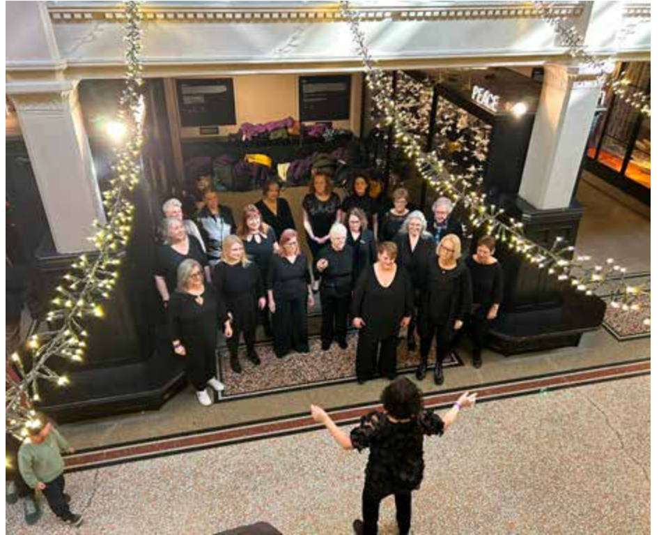
Performing at the Dinosaur Museum