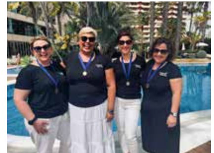
Barberlicious at BIBA