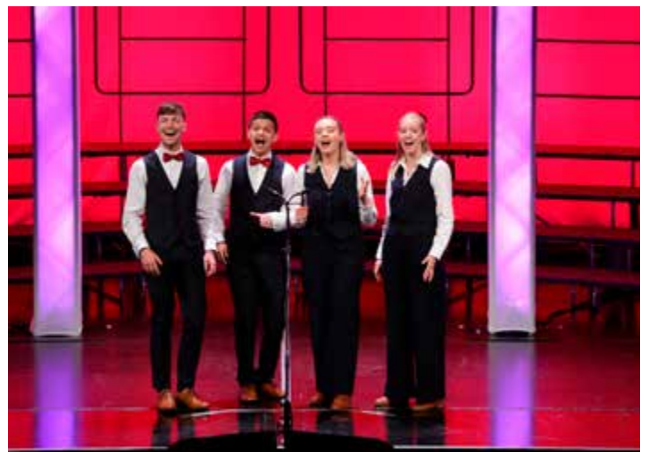
Youth Quartet Champions, Ami Quartet