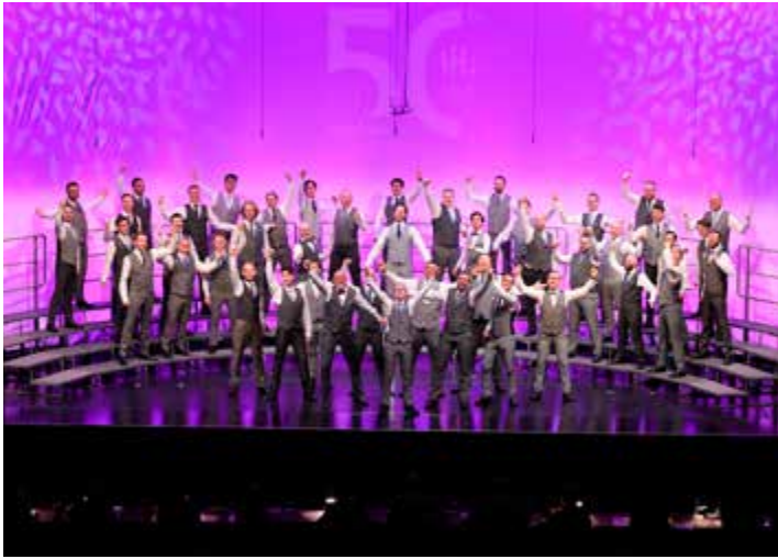
Male Chorus Champions, Meantime Chorus